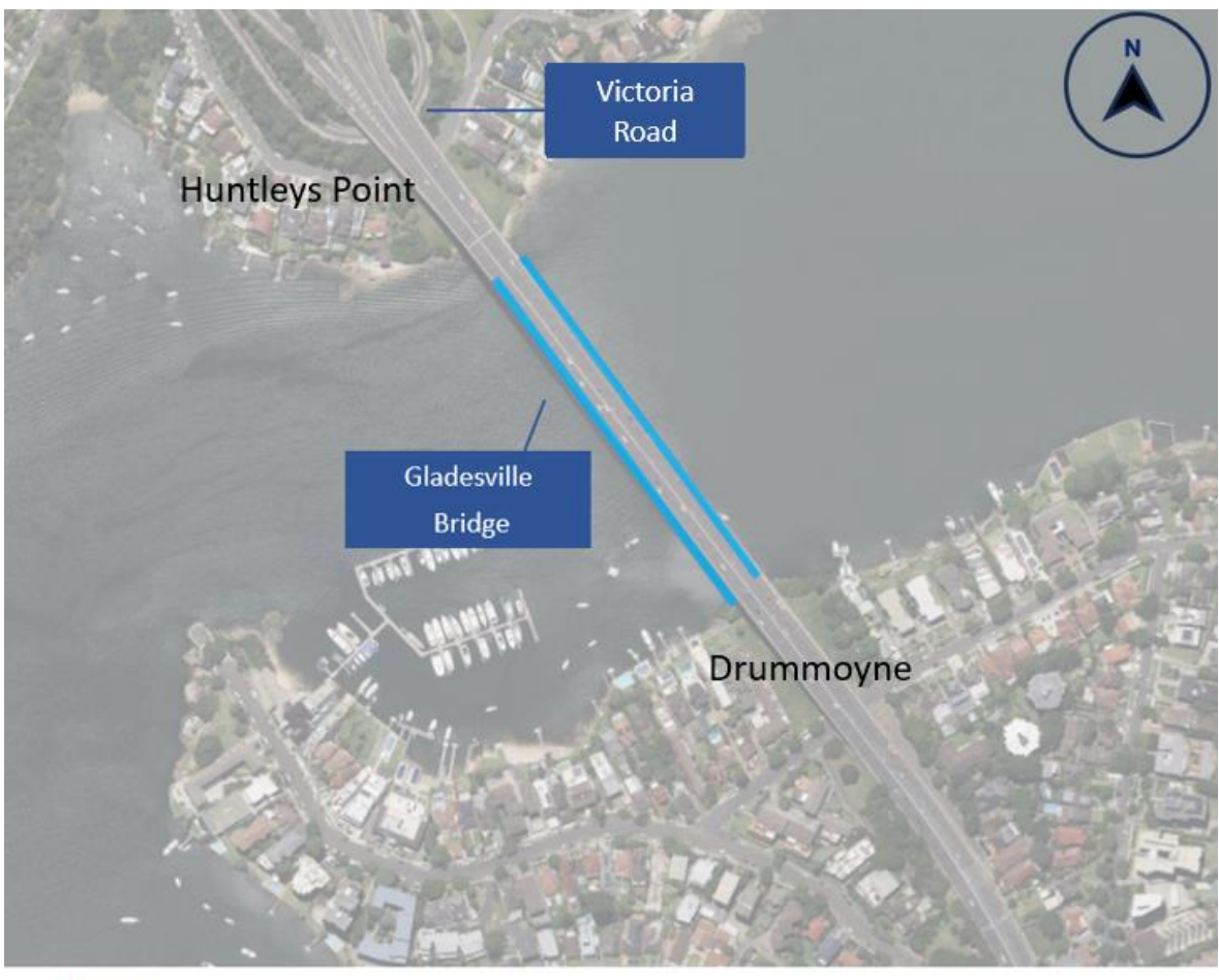
KEY Work Zones