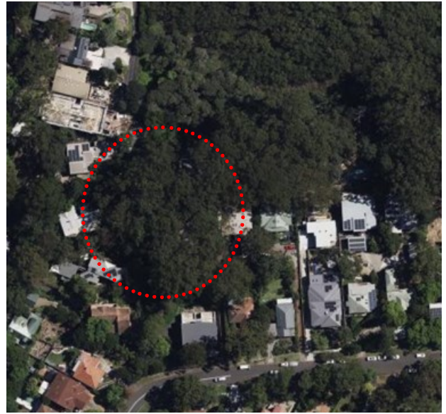
Aerial image 2024